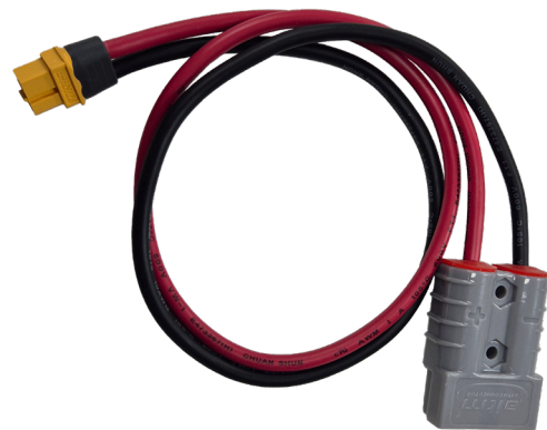
Cigarette plug power cable, or Anderson power cable 50cm power lead with XT60 connector