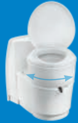
Swivel bowl model

A perfect home-like toilet solution built-in a recreational vehicle