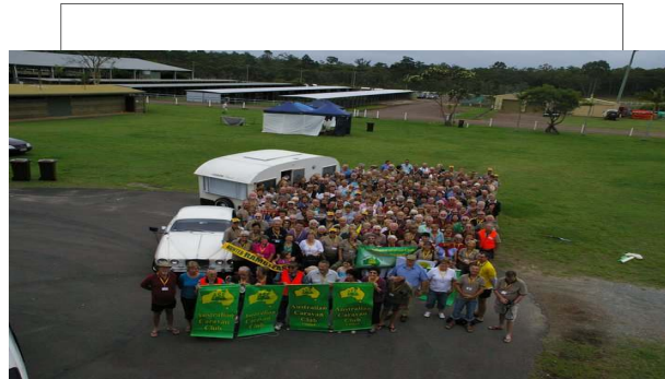
Australian Caravan Club National Muster 2010