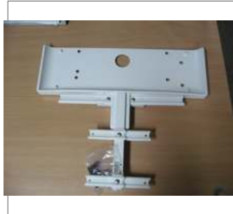
Winegard Wingman Add-on.

New to Australia and just arrived, the new Wingman for your Winegard Antenna enhances the UHF range and gives you even more channels.