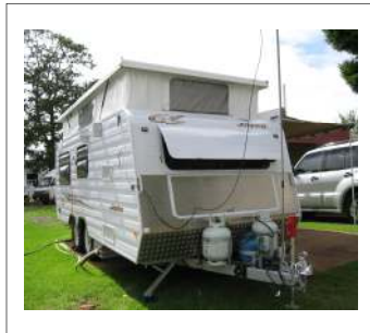
All set up ready to relax and enjoy.

So give us a call and we can arrange for your van to be serviced and ready for your next adventure!