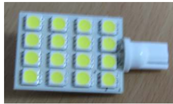
Jayco ceiling lights.

This Led bulb replaces your T10 Wedge incandescent bulb.– commonly found in