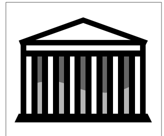
The BATMAX Battery Maximizer valued at $99.50

Winner to be drawn on Wednesday 29th February 2012. Good luck!